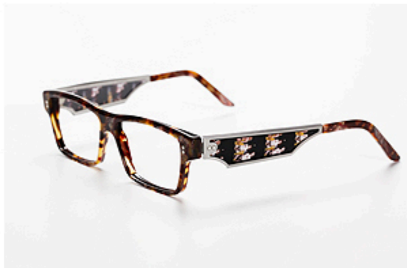
Pictured: Frame by TipTon, $450.00

Karir's new flagship store is located in First Canadian Place on the main level, Adelaide Street entrance. Karir stores can also be found in Yorkdale Shopping Center and in Toronto's Yorkville shopping district, on Old York Lane. See the full line at: www.karireyewear.com and order glasses via objects@karireyewear.com .