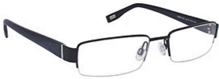
Pictured: Evatik 9027-161: $305

The Evatik line is available at 450 independent retailers across Canada, and can be viewed in its entirety at www.evatik.com