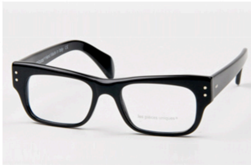
Pictured: Max 03, $279.99