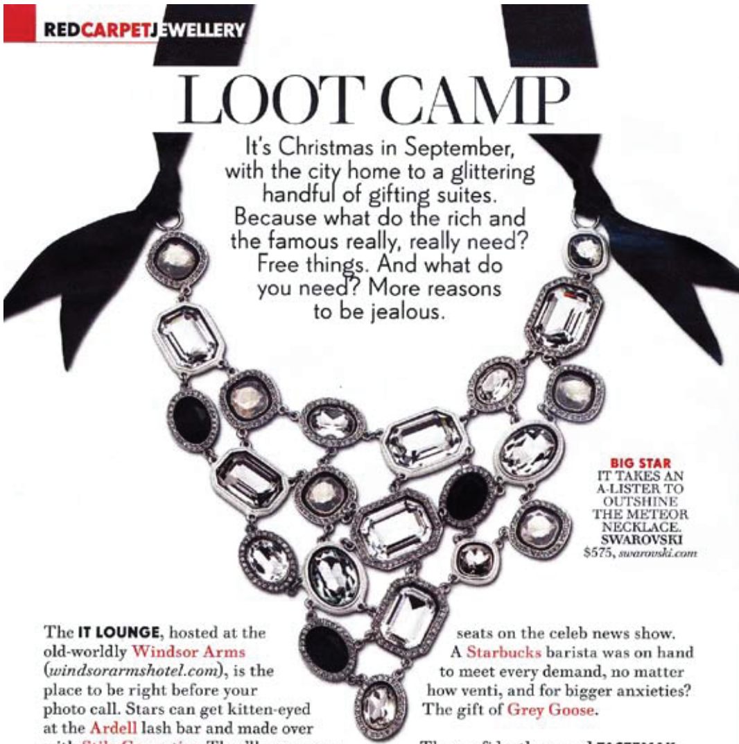
BIG STAR IT TAKES AN A-LISTER TO OUTSHINE THE METEOR NECKLACE. SWAROVSKI $575, swarovski.com

It's Christmas in September, with the city home to a glittering handful of gifting suites. Because what do the rich and the famous really, really need? Free things. And what do you need? More reasons to be jealous.